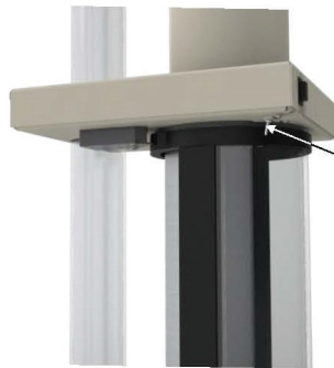
Night Lock Switch