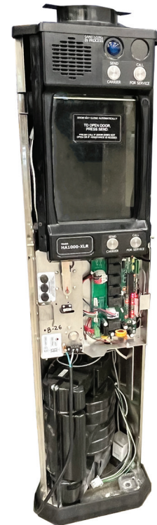
An inside look at a HA1000-XLR unit with the UVC Light Kit

The blue indicator light illuminates during the sanitizing process.